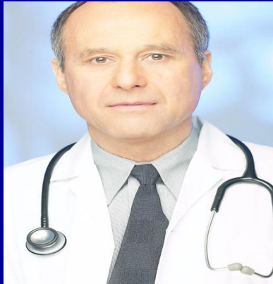
Medical - Health