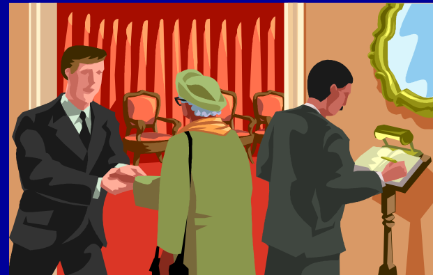
Death – Bereavement